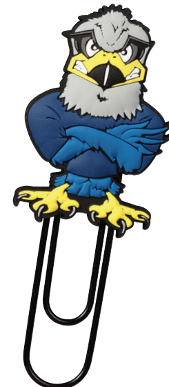
PVC CLIPS WITH MAGNETS