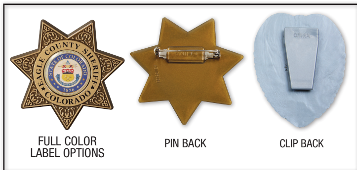
FULL COLOR LABEL OPTIONS