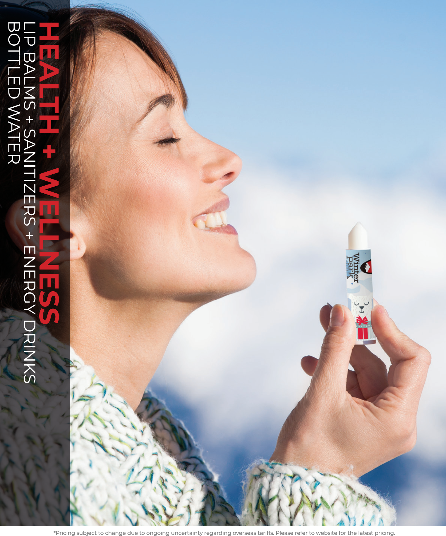
*Pricing subject to change due to ongoing uncertainty regarding overseas tariffs. Please refer to website for the latest pricing. OUR FULL LINE AT TEKWELD.COM | ASI: 90807 | SAGE: 67569 | PPAI: 266346