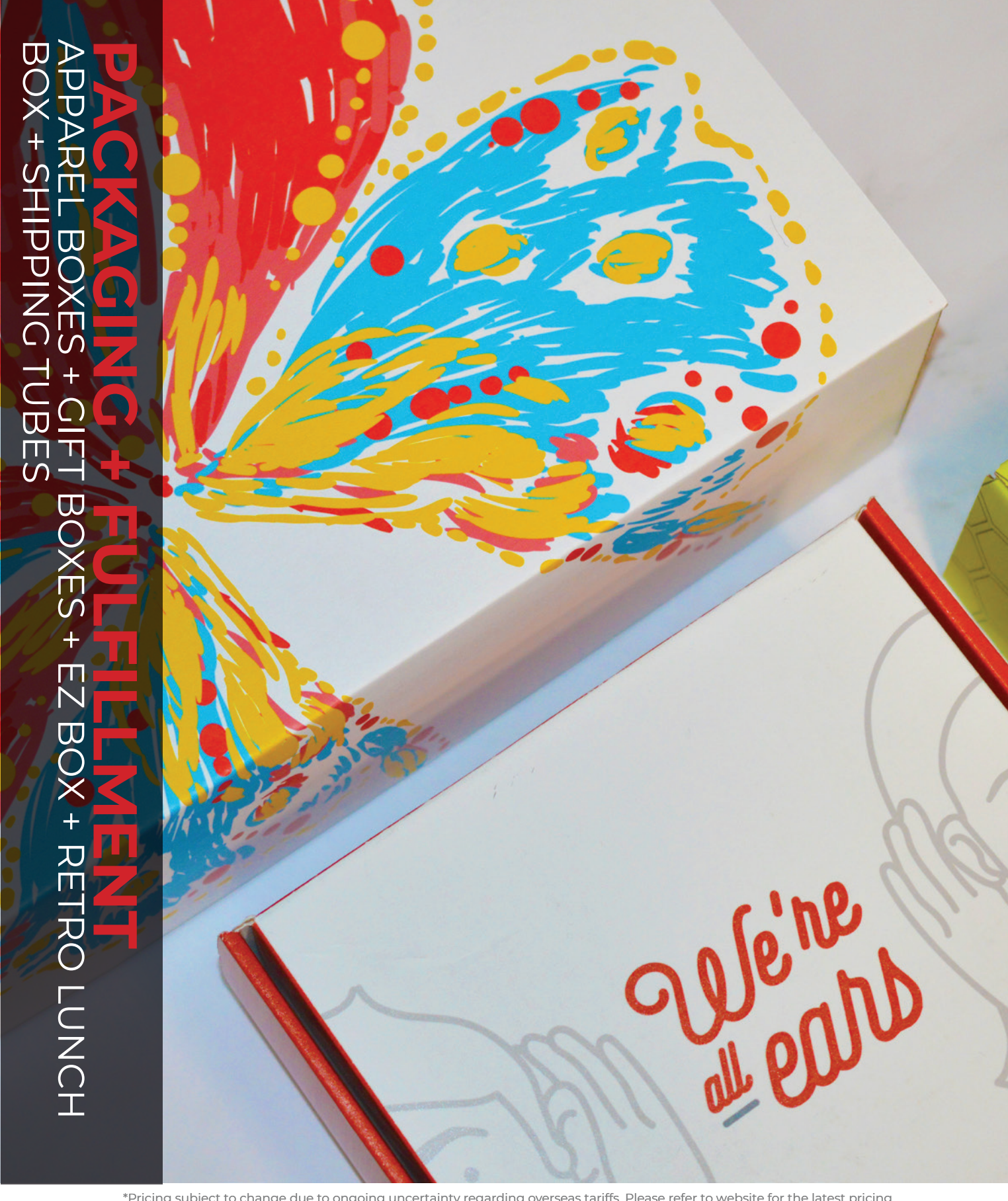
*Pricing subject to change due to ongoing uncertainty regarding overseas tariffs. Please refer to website for the latest pricing. OUR FULL LINE AT TEKWELD.COM | ASI: 90807 | SAGE: 67569 | PPAI: 266346