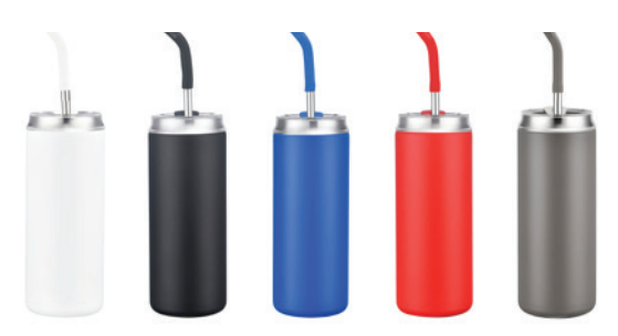
FOB CITY OF INDUSTRY, CA 91789