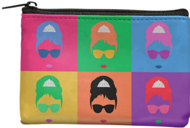
5"W X 3.5"H VEGAN LEATHER CHANGE PURSE BAG503

Features: Made of Vegan Leather. This change purse has a secure zipper that keeps contents safe and the exterior features stunning full color digital printing on both sides to highlight your brand message.