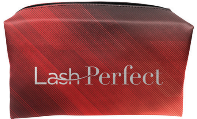
9"W X 4.33"H X 4.33"D rPET TRAVEL BAG / TOILETRY MAKEUP BAG BAG701

Features: Three useful compartments and zippered PVC middle compartment. Wide 180-degree opening to provide an extra big opening that rests flat, allowing you to readily view all objects without losing anything at the bottom. Made of recycled polyester (rPET).