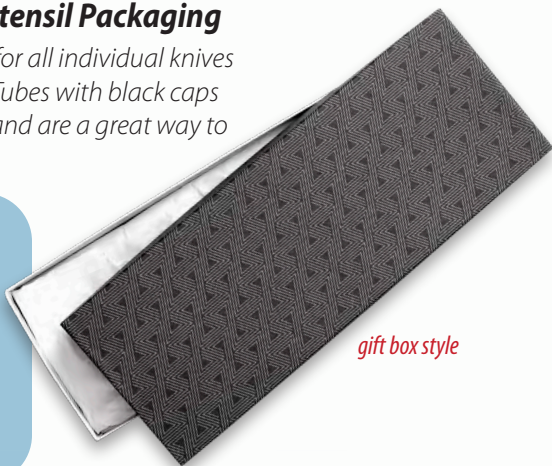
gift box style

Utensils, larger knives, and combinations of different items can be packaged in gift boxes . Customer Service can confirm which box will work with your selection.