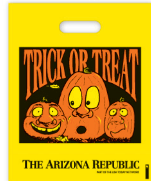
Stock Design #4