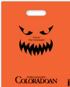
Stock Design #1