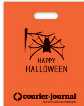
Stock Design #3