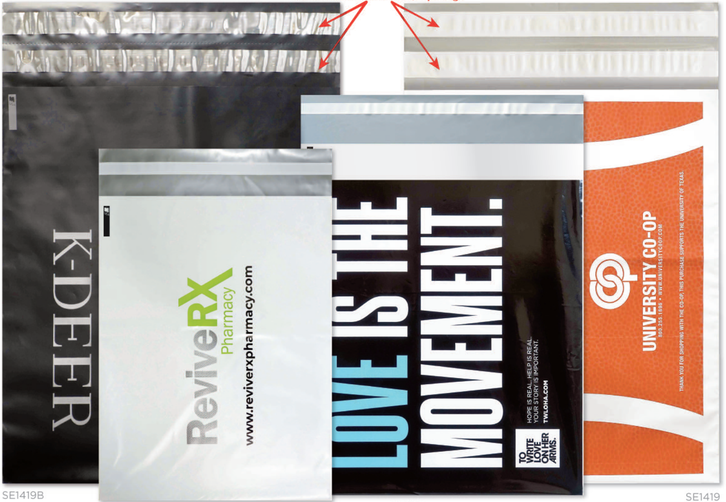
SE1419B SE1013 SE1215 SE1419

Returnable Double adhesive tape available. 5,000 Minimum, inquire for pricing.