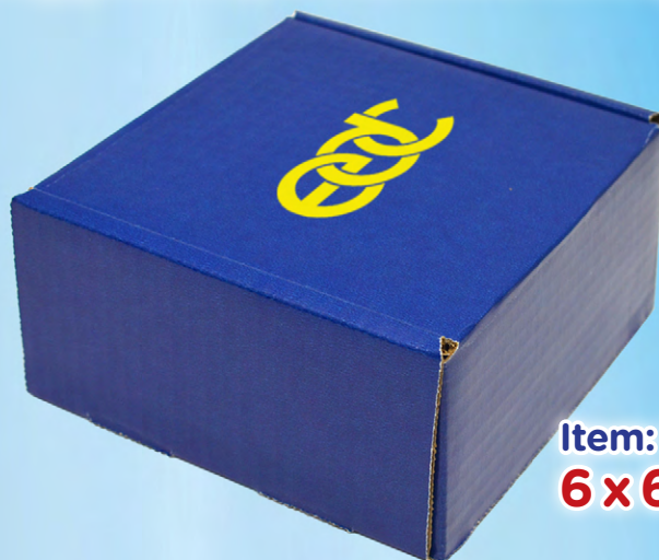
Item: 791663 6 x 6 x 3"