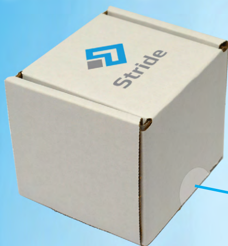
Item: 791444 4 x 4 x 4"

Our 200lb Test, B-flute corrugated tuck mailing boxes come in a variety of sizes and gloss color exteriors, with kraft interior. Ship as is, or with our protective Polyolefin clear film, allowing your imprint to show through!