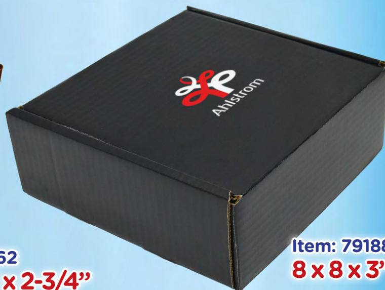
Item: 791883 8 x 8 x 3"