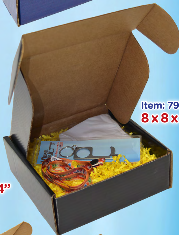
Item: 791883 8 x 8 x 3"

*Pictured items not included. Catalog pricing applies.