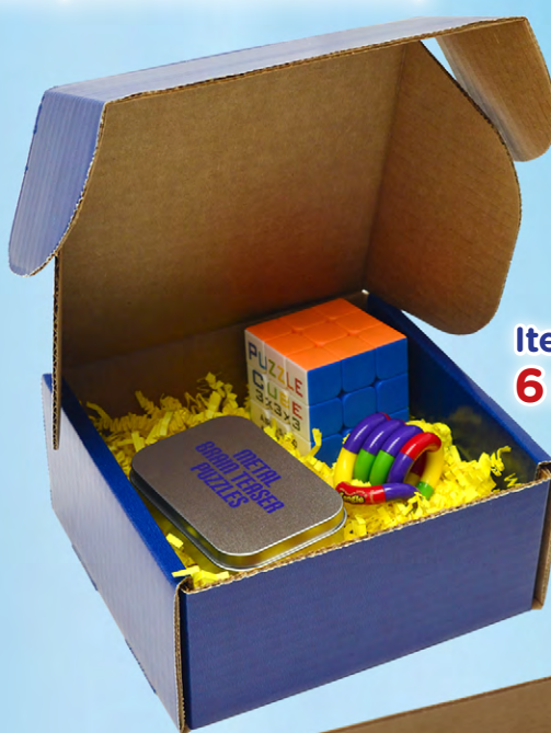
Item: 791663 6 x 6 x 3"