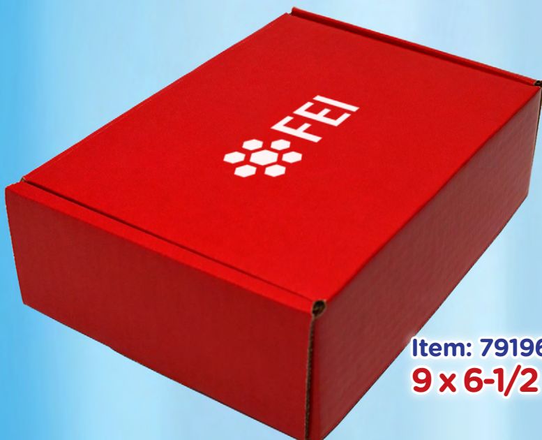
Item: 791962 9 x 6-1/2 x 2-3/4"