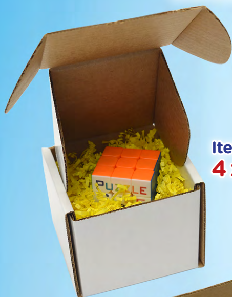
Item: 791444 4 x 4 x 4"

We can do that too! (Call for insertion cost)