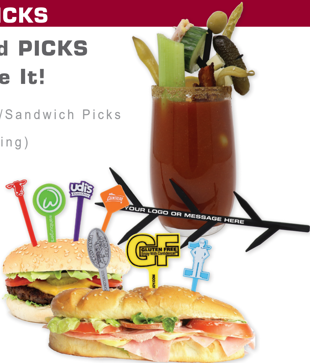
The following picks are examples of custom order designs.