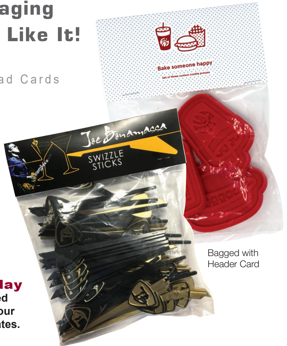
Bagged with Header Card

Give us a call today to discuss your customized requirements with one of our experienced sales associates.