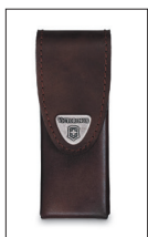
Comes with Brown Leather Pouch