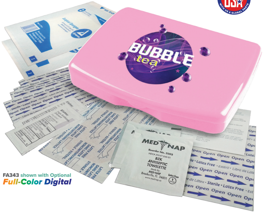
FA343 shown with Optional Full-Color Digital