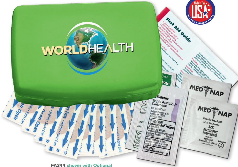
FA344 shown with Optional Full-Color Digital