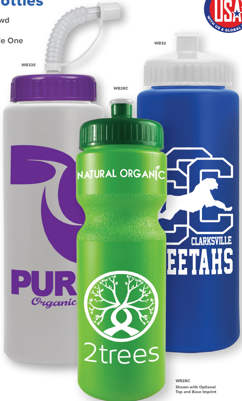
WB28C Shown with Optional Top and Base Imprint