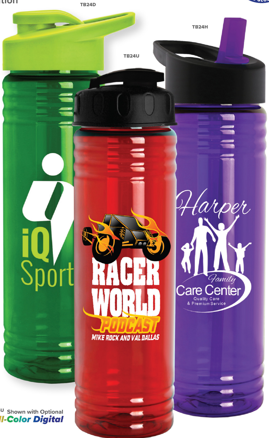
TB24U Shown with Optional Full-Color Digital

* Available with 12 Lid Styles Visit www.garyline.com for complete listing