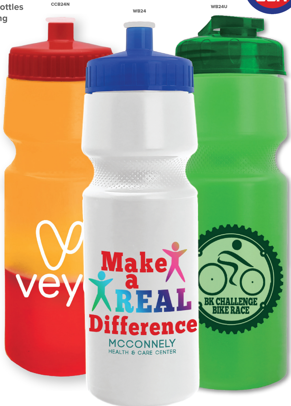
WB24 Shown with Optional Full-Color Digital