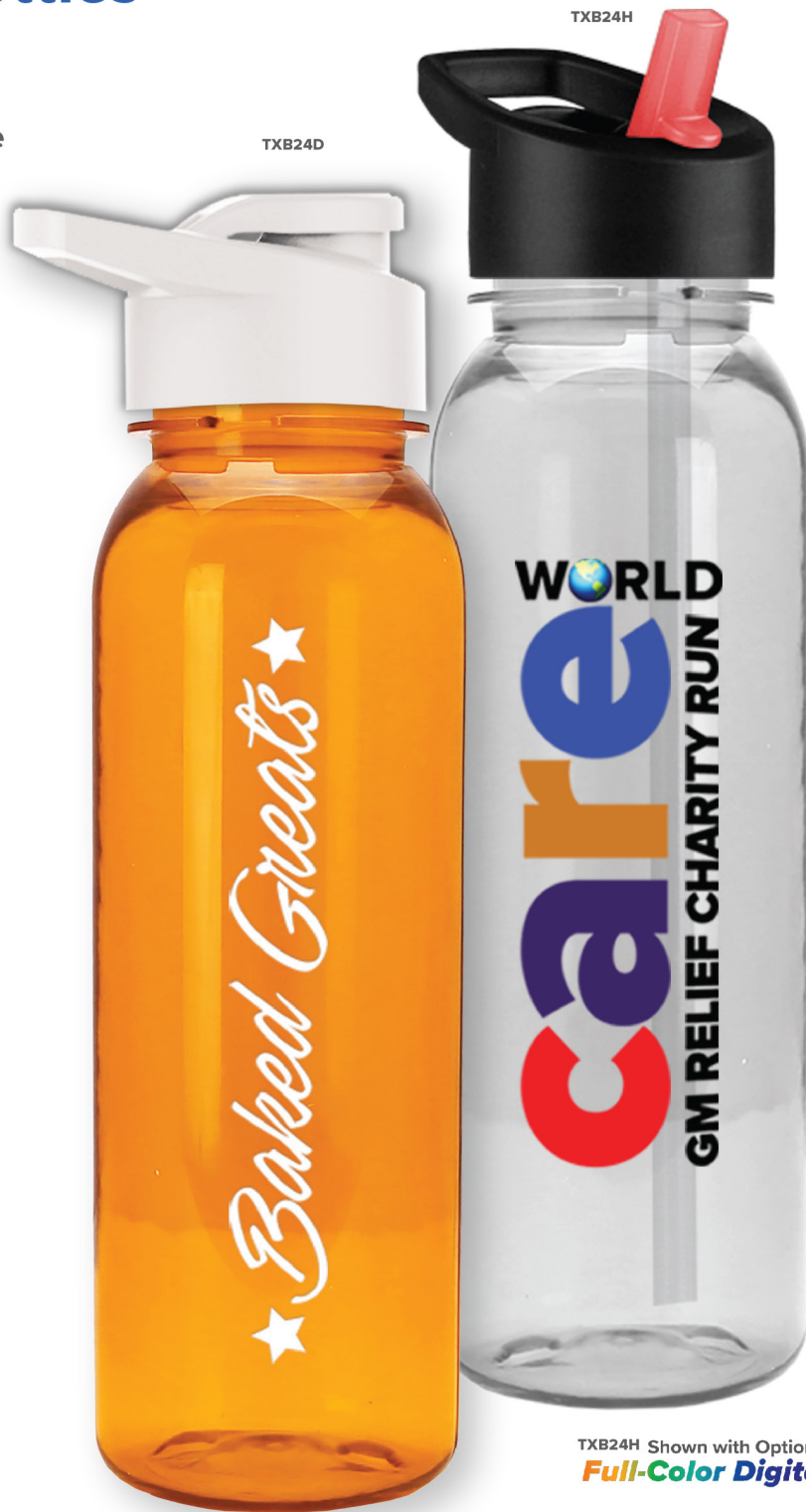
TXB24H Shown with Optional Full-Color Digital

* Available with 12 Lid Styles Visit www.garyline.com for complete listing