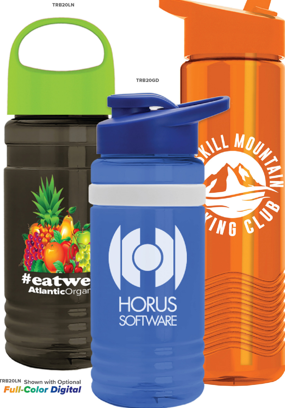
TRB20LN Shown with Optional Full-Color Digital

* Available with 12 Lid Styles Visit www.garyline.com for complete listing