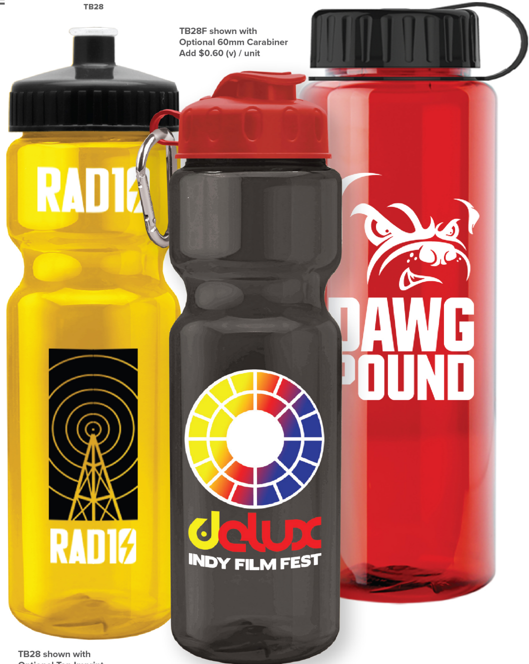
TB28 shown with Optional Top Imprint