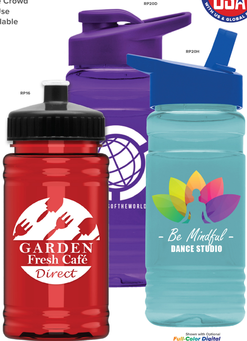
Shown with Optional Full-Color Digital