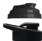
SHC Drink-Thru Lid and Drink-Thru Lid