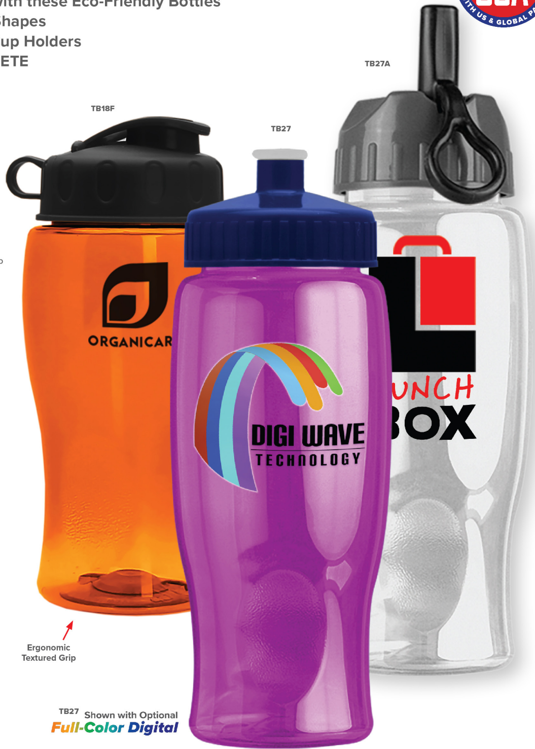
TB27 Shown with Optional Full-Color Digital