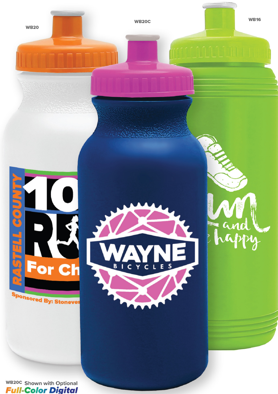
WB20C Shown with Optional Full-Color Digital