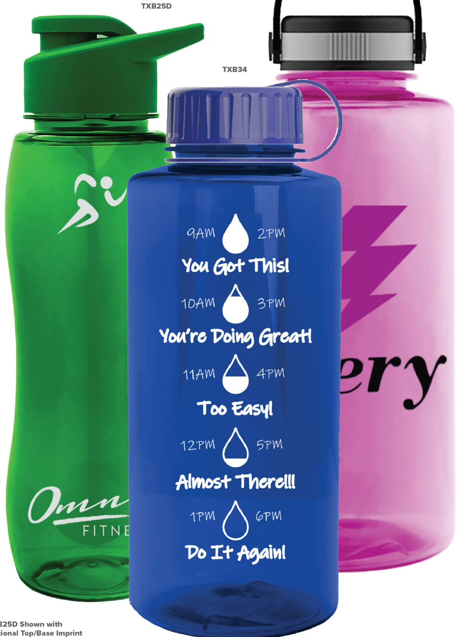
TXB25D Shown with Optional Top/Base Imprint

* Available with 12 Lid Styles Visit www.garyline.com for complete listing