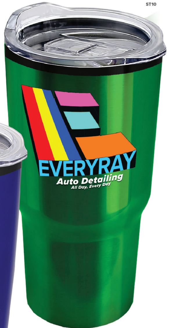
ST10 Shown with Optional Full-Color Digital