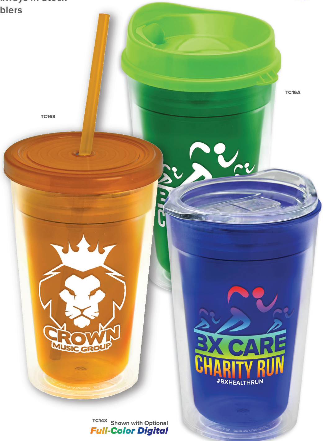
TC14X Shown with Optional Full-Color Digital