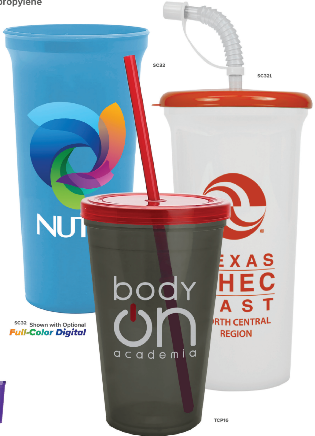
SC32 Shown with Optional Full-Color Digital

Product Size: 5-5/8" H x 3-3/4" W Imprint Area: 3-1/4" H x 3" W / Side Wrap Imprint: 3-1/4" H x 8" W x 1-1/2" Gap Standard Packing: 100 Units / Carton 22 lbs Carton Size: 27" x 20" x 19"