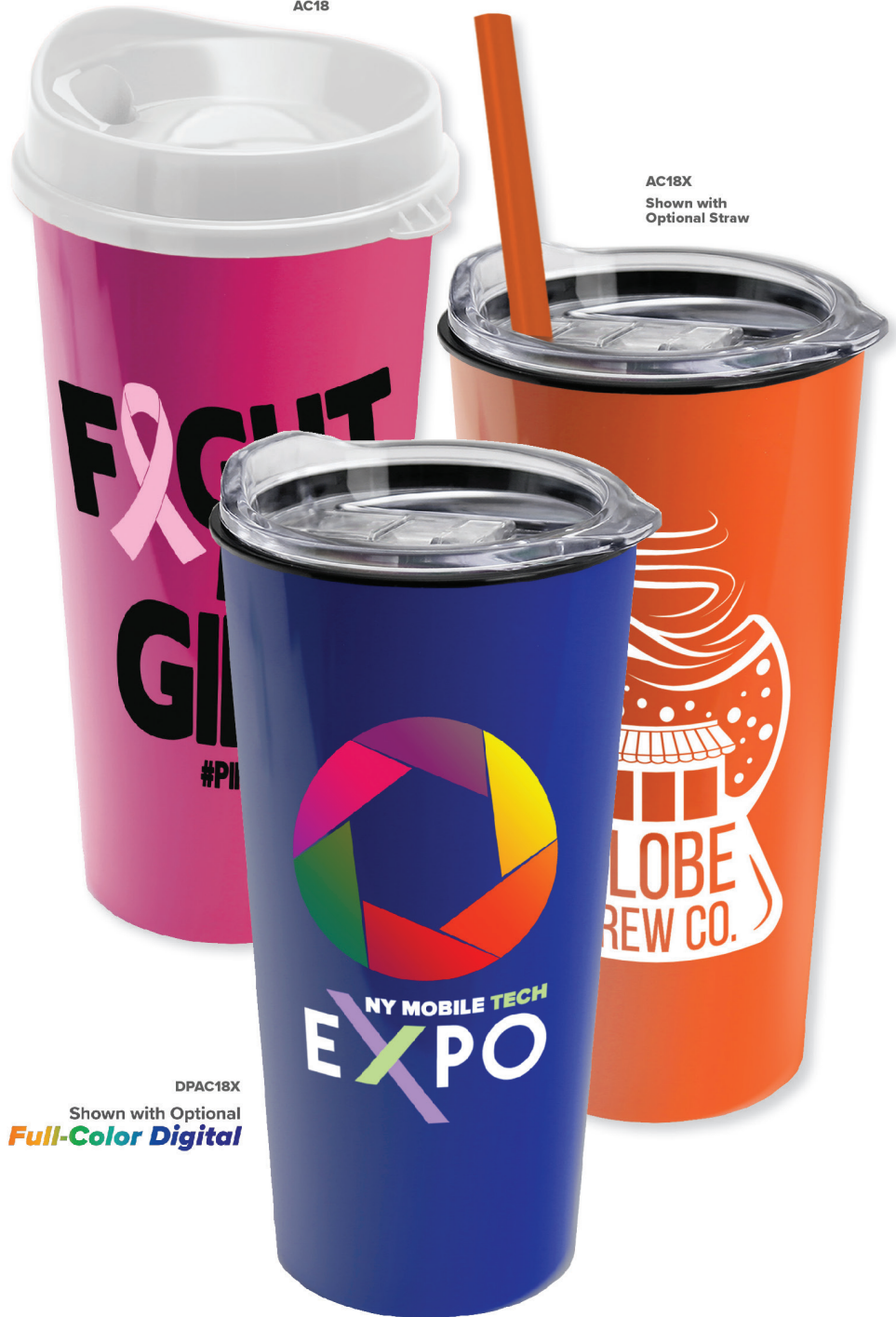
DPAC18X Shown with Optional Full-Color Digital