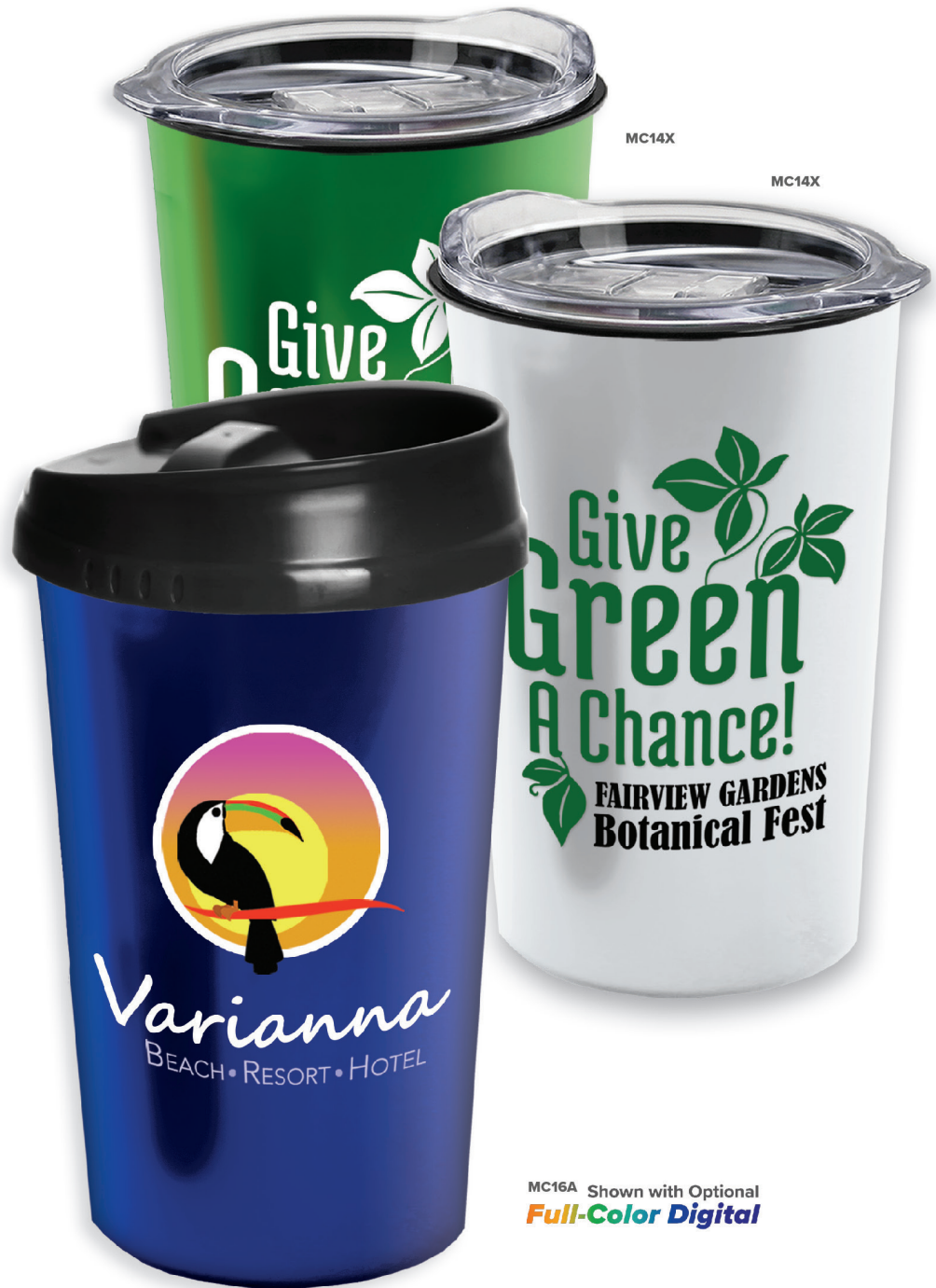
MC16A Shown with Optional Full-Color Digital