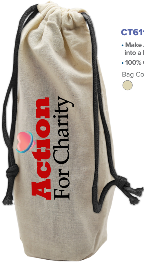
Shown with Optional Full-Color Digital

Individual Mailing Available - Call for Pricing