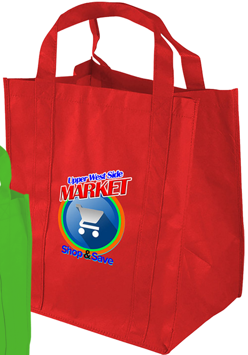
Shown with Optional Full-Color Digital