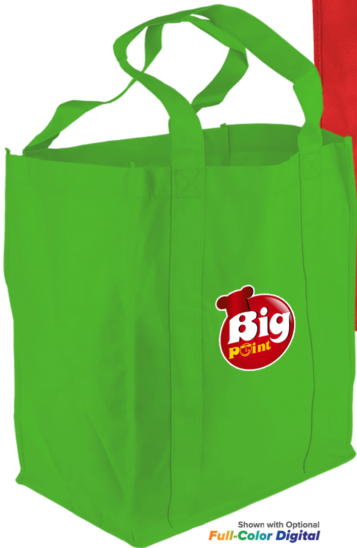
Shown with Optional Full-Color Digital