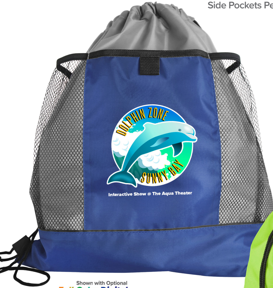
Shown with Optional Full-Color Digital

The Right Bag for an Active Lifestyle. Multiple Compartments for Convenience. Side Pockets Perfect for Adding A Reusable Sports Bottle.