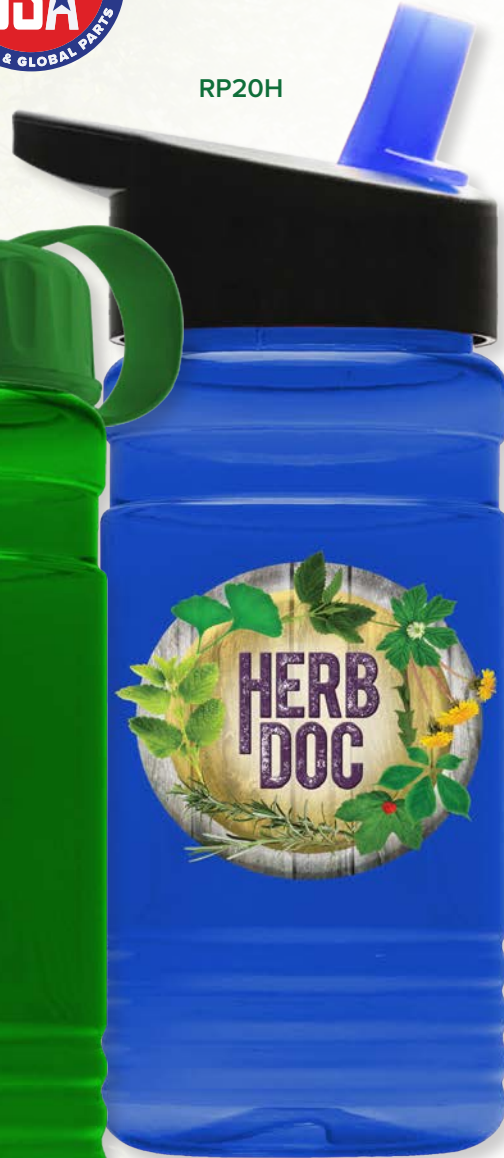
RP20H shown with Optional Full-Color Digital