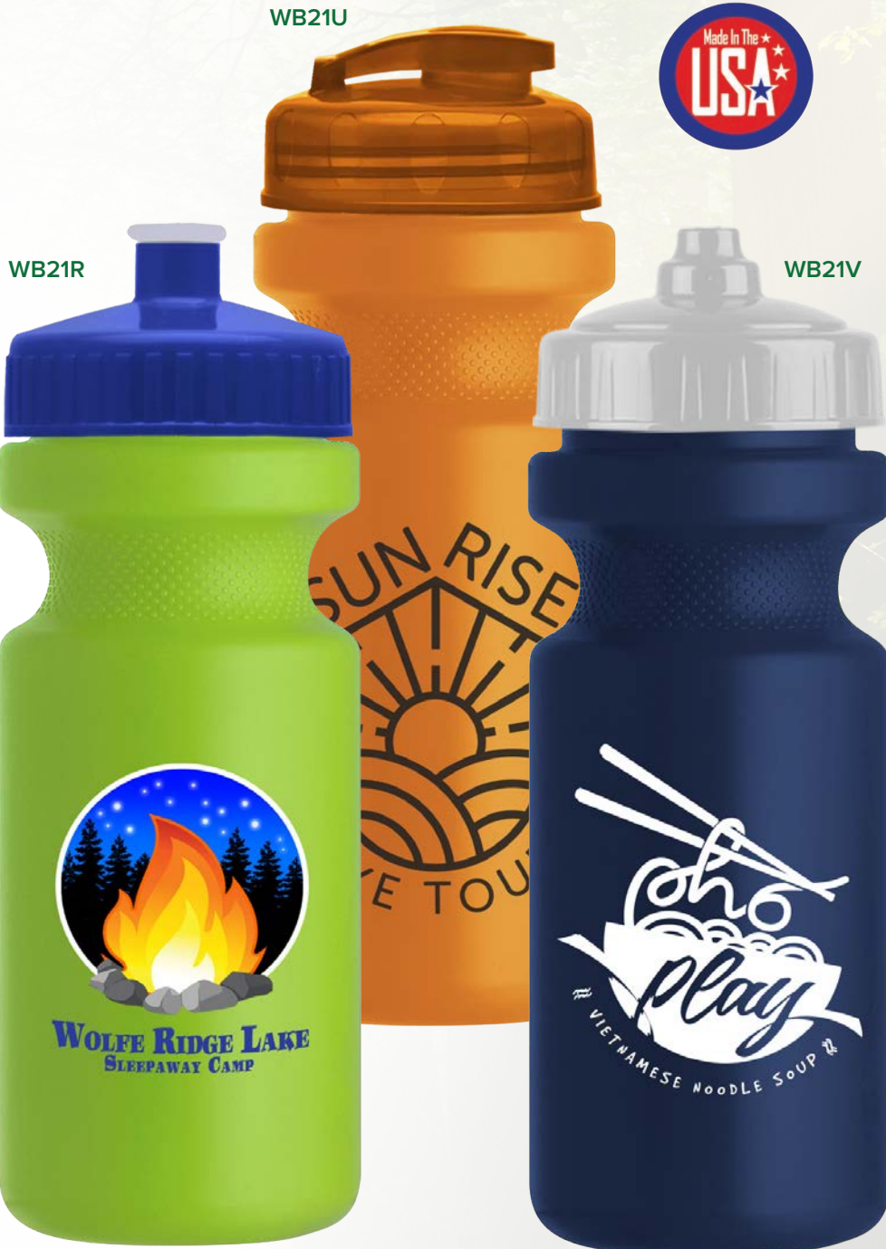
WB21R shown with Optional Full-Color Digital