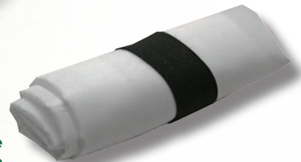
DPBRP13 shown with Optional Full-Color Digital

Folds Down for Easy Storage With Included Elastic Strap