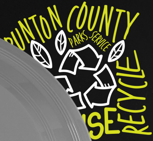
DPFLY9R shown with Optional Full-Color Digital