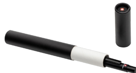
Swiss Force® Packaging