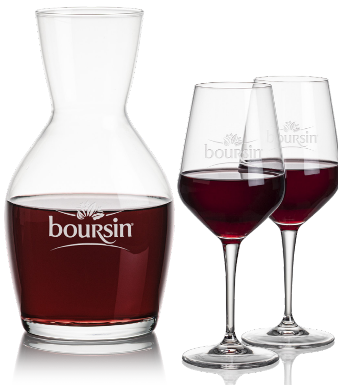
Westwood Carafe & Germain Wine BWC915-2GM