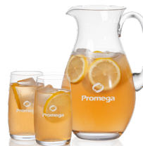
Valemount Beverage Set BWC1225-2VM