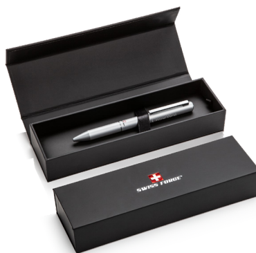
Swiss Force® Gift Box