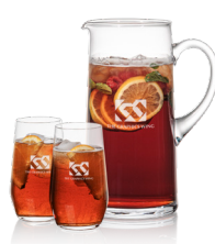
Germain Beverage Set REX401-2GM