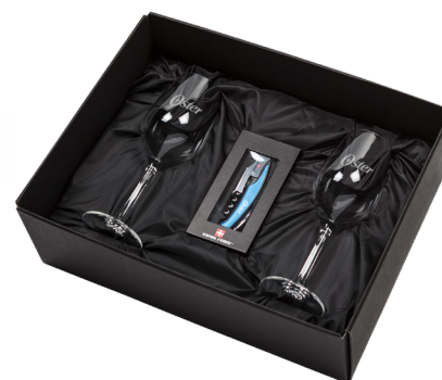
All Packaged in a Premium Satin-Lined Gift box

Available in Sets with Various Glasses. See Website for the Full Range!