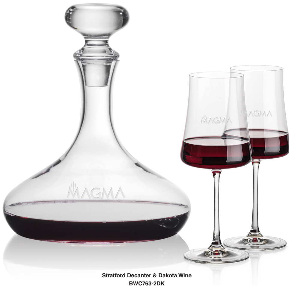
Stratford Decanter & Dakota Wine BWC763-2DK