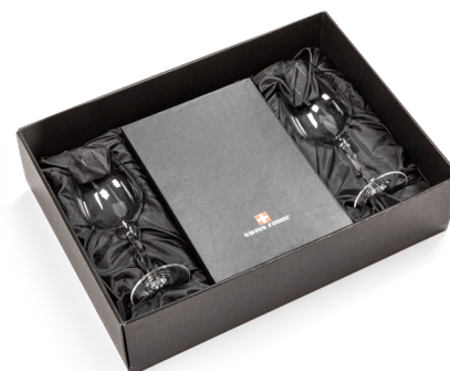
All Packaged in a Premium Satin-Lined Gift box

Our popular Wine Glasses are paired with our Swiss Force® Wine Opener Set and packaged in a satin-lined presentation gift box for an elegant giftset for any occasion.