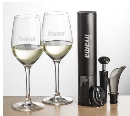
Swiss Force® Opener & 2 Lethbridge Wine BWA103-2LB