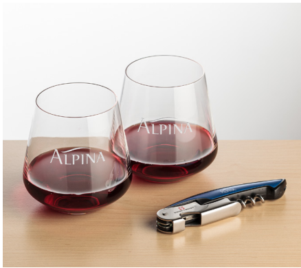
Swiss Force® Opener & 2 Cannes Stemless BWA101-2N

Available in Sets with Various Glasses. See Website for the Full Range!