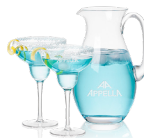
St Tropez Cocktail Set BWC12251-2ST

*SETUP CHARGES APPLY. PRICES SUBJECT TO CHANGE. VISIT WWW.STREGISGRP.COM FOR UP-TO-DATE PRICING.