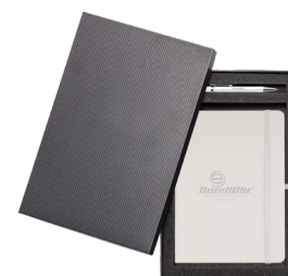
Optional Atlas Pen Gift Set TBC401-315G (See website for details)