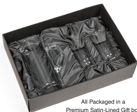
All Packaged in a Premium Satin-Lined Gift box