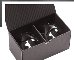
Includes Black Gift Box