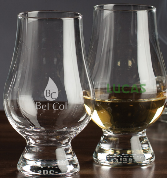
Glencairn Scotch Whiskey 6.75 oz Deep Etched / Imprinted