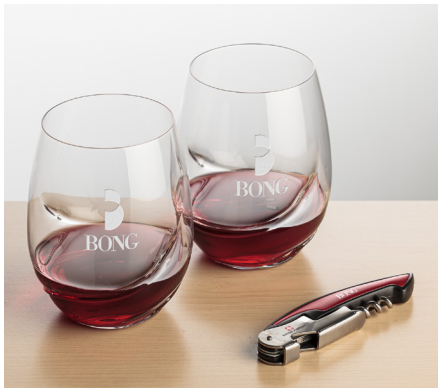
Swiss Force® Opener & 2 Bartolo Stemless BWA101-2L