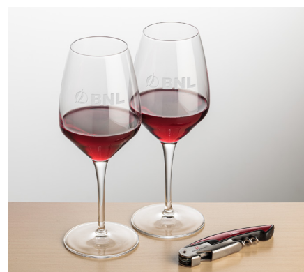
Swiss Force® Opener & 2 Brunswick Wine BWA102-2B