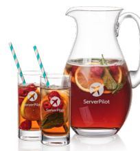
Dresden Beverage Set BWC1225-2DR