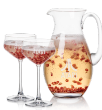
Bretton Cocktail Set BWC12251-2BT