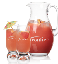
Marland Cocktail Set BWC12251-2ML