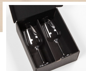
Includes Black Gift Box