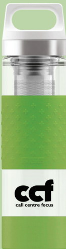
Hot & Cold Glass