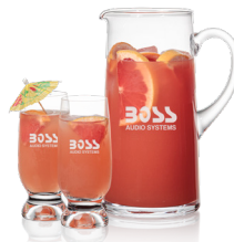
Marland Cocktail Set REX4011-2ML