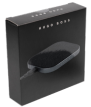
HUGO BOSS® PACKAGING