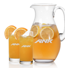
Franca Beverage Set BWC1225-2FR