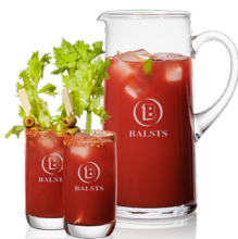
Sandown Beverage Set REX401-2SD