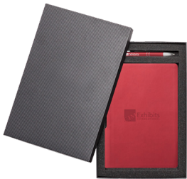
Optional Clicker Pen Gift Set TBC408-197G (See website for details)

Get into the GROOVE! This sleek, flexible journal is the top choice for meetings and gifts.