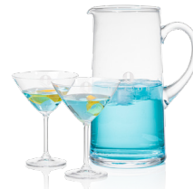
Coleford Cocktail Set REX4011-2CF