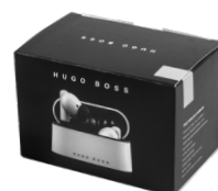
HUGO BOSS® PACKAGING