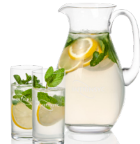
Stockton Beverage Set BWC1225-2ST