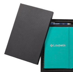
Optional Kurt Pen Gift Set TBC435-319G (See website for details)