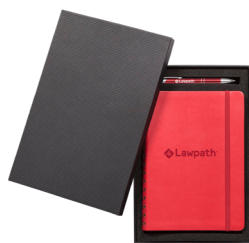
Optional Clicker Pen Gift Set TBC435-197G (See website for details)