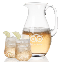
Breckland Beverage Set BWC1225-2BL