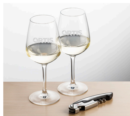
Swiss Force® Opener & 2 Mandelay Wine BWA102-2M