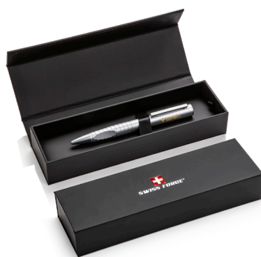
Swiss Force® Gift Box