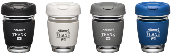
BLACK WHITE GRAY BLUE

The Retiro Borosilicate Glass Tumbler holds up to 8oz of your favorite hot or cold beverage and features a silicone lid and sleeve for a comfortable easy grip. This tumbler is the perfect size for a beverage on-the-go.