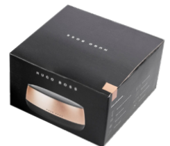
HUGO BOSS® PACKAGING