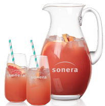
Hogarth Beverage Set BWC1225-2HG