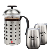
SET OF 3