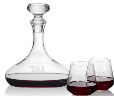
Stratford Decanter & Cannes Stemless Wine BWC7631-2CN