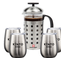
SET OF 5