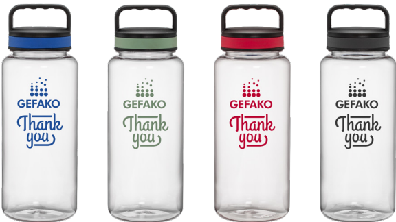
BLUE GREEN RED GRAY

The Brecon Wide Mouth Bottle w/Twist Lid is the perfect bottle for holding a large amount on-the-go. Holding up to 42oz of a cold beverage, this bottle will keep you hydrated all day.