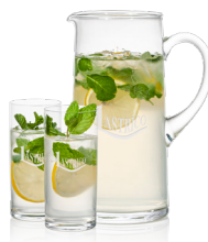
Stockton Beverage Set REX401-2ST