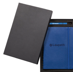
Optional Austen Pen Gift Set TBC435-2372G (See website for details)