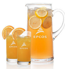
Franca Beverage Set REX401-2FR