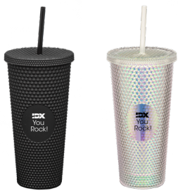
MATTE IRIDESCENT BLACK

Sip in Style with our Crenshaw Textured Tumbler w/Straw. A great tumbler for your favorite cold beverage on-the-go or at home. This tumbler is perfect to promote your brand as it is sure to catch everyone's eye.