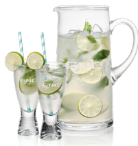
Bastien Cocktail Set REX4011-2BS