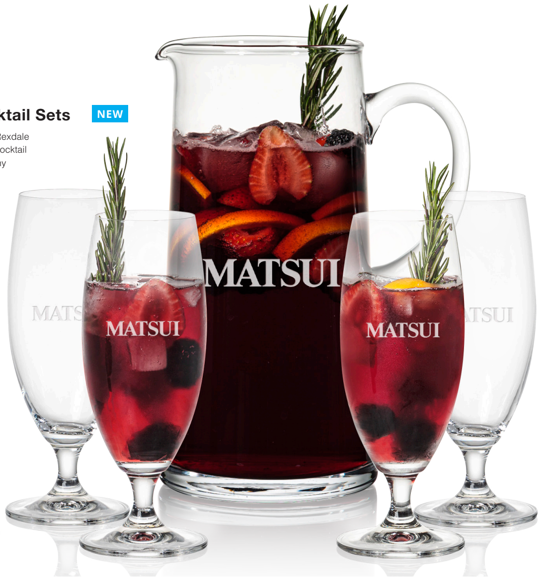
Rexdale Pitcher & Pinehurst Cocktail Set REX4011-2PH Available in Set of 2's or 4's