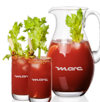
Sandown Beverage Set BWC1225-2SD