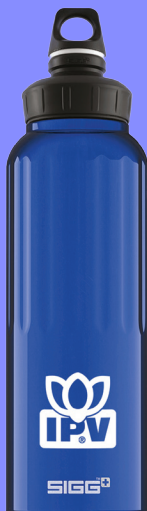
WMB Classic Traveller Mountain