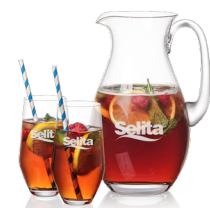
Graydon Beverage Set BWC1225-2GR