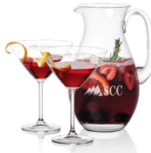
Coleford Cocktail Set BWC12251-2CF