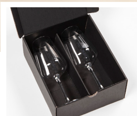
Includes Black Gift Box