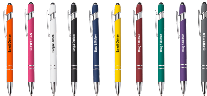
ORANGE PINK WHITE BLACK BLUE YELLOW RED GREEN PURPLE GRAY