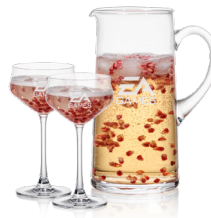
Bretton Cocktail Set REX4011-2BT