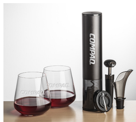
Swiss Force® Opener & 2 Breckland Wine BWA1031-2BK Available in Sets of 2's or 4's

Available in Sets with Various Glasses. See Website for the Full Range!