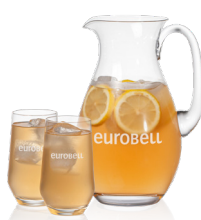
Bexley Beverage Set BWC1225-2BX