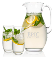
Charleston Beverage Set BWC1225-2CS