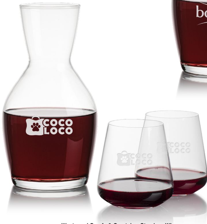
Westwood Carafe & Crestview Stemless Wine BWC9151-2CV