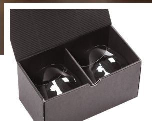
Includes Black Gift Box