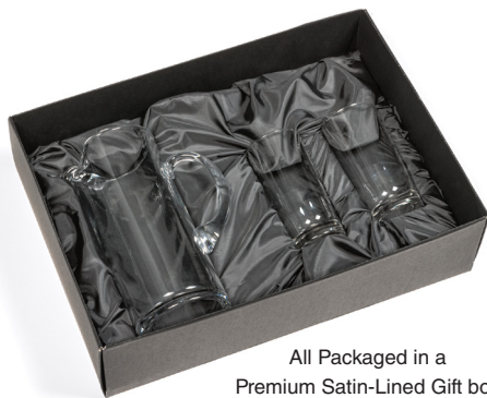
All Packaged in a Premium Satin-Lined Gift box