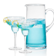
St Tropez Cocktail Set REX4011-2ST