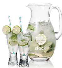
Bastien Cocktail Set BWC12251-2BS