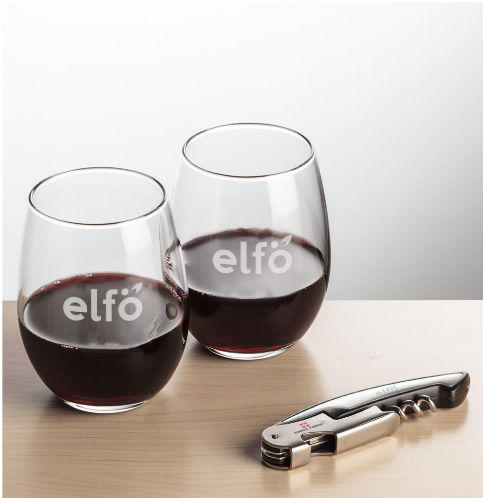
Swiss Force® Opener & 2 Stanford Stemless BWA101-2S