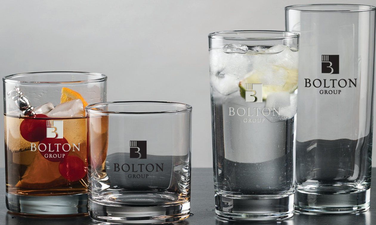
Double Old Fashioned 14 oz