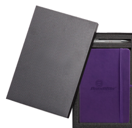
Optional Clicker Pen Gift Set TBC401-197G (See website for details)