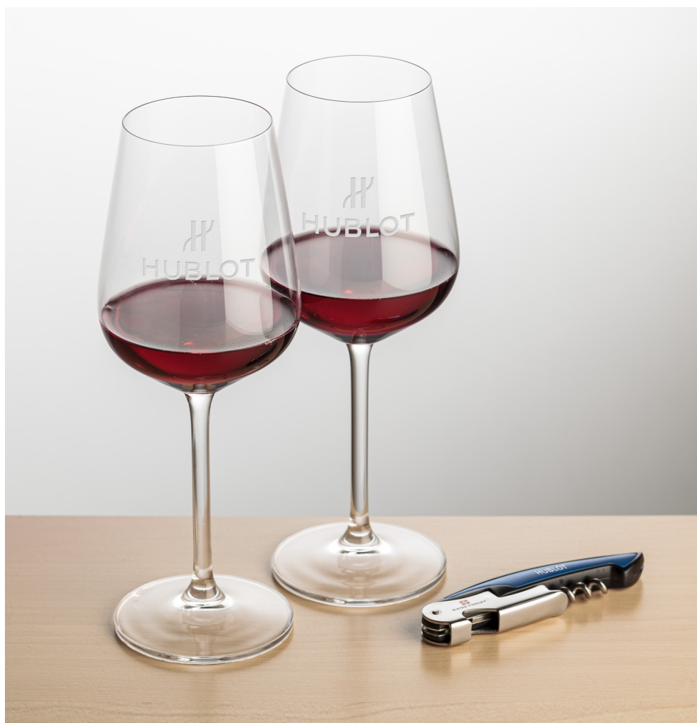
Swiss Force® Opener & 2 Elderwood Wine BWA102-2E