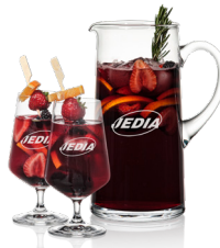
Breckland Cocktail Set REX4011-2BL