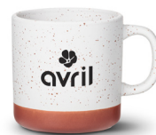
Matte White Available Imprint Only