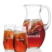
Germain Beverage Set BWC1225-2GM