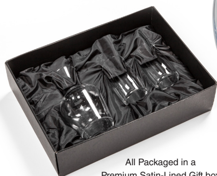
All Packaged in a Premium Satin-Lined Gift box