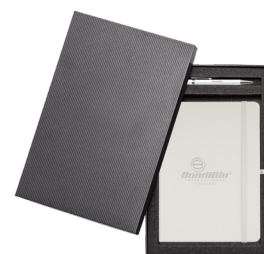
Optional Clicker Pen Gift Set TBC470-197G (See website for details)