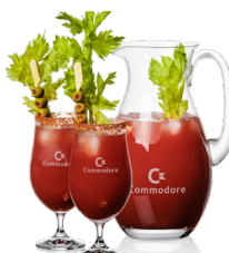
Rochdale Cocktail Set BWC12251-2RD