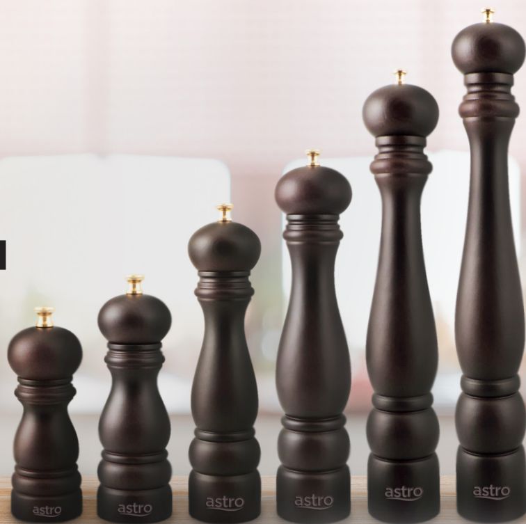
SWISSMAR® MUNICH MILL

The Swissmar® Salt & Pepper Mills are classically designed with a precise grind adjustment mechanism on each mill to make cooking easier. With a breadth of diverse mill sizes and styles, Swissmar® has the perfect mill for your exact needs.