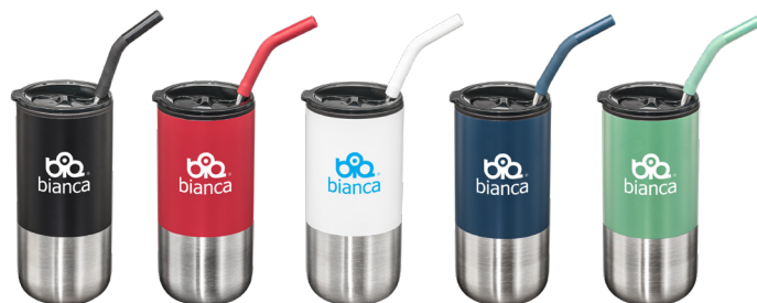
BLACK RED WHITE BLUE TEAL