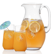
Bretton Beverage Set BWC1225-2BT