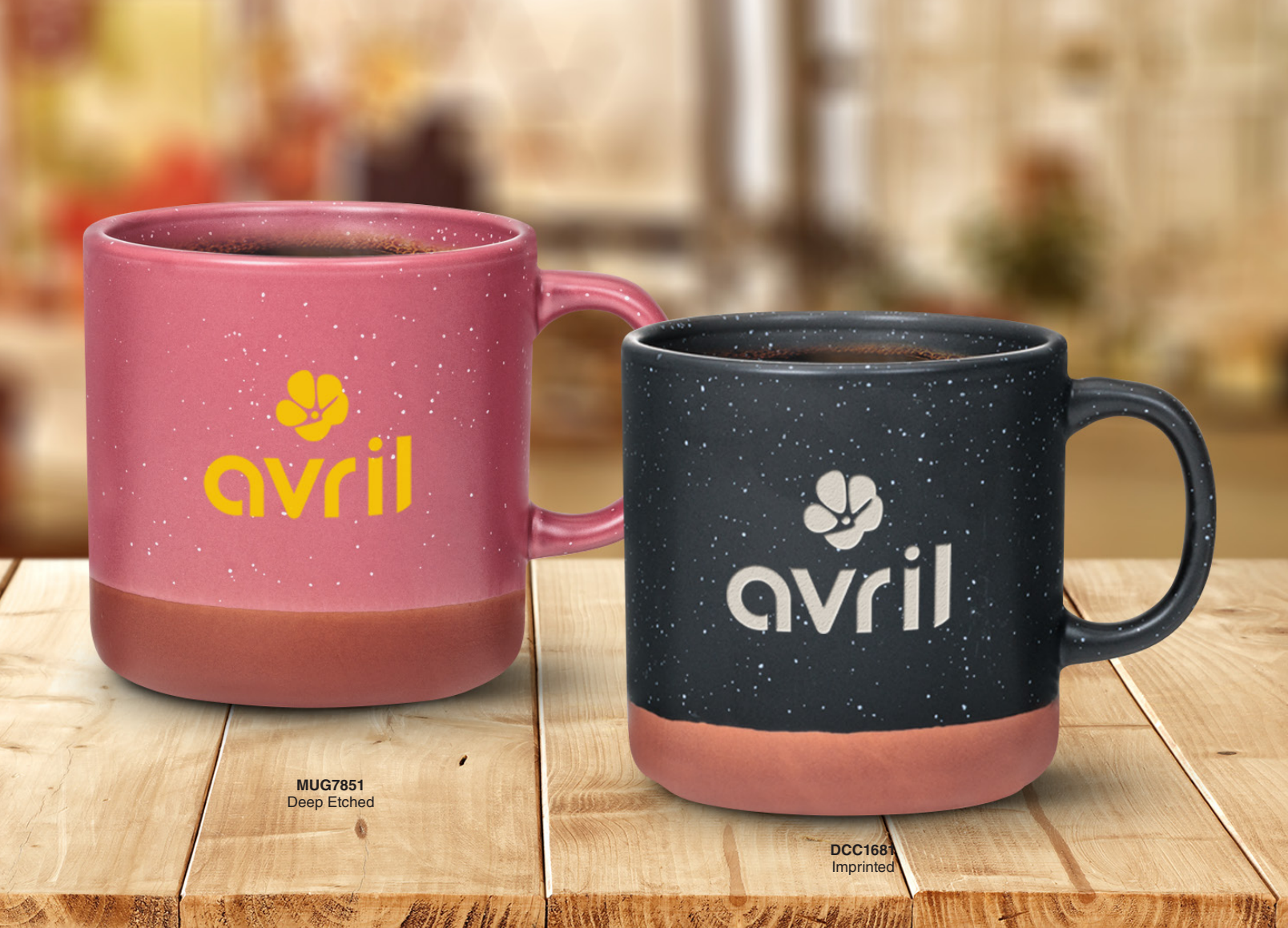
MUG7851 Deep Etched