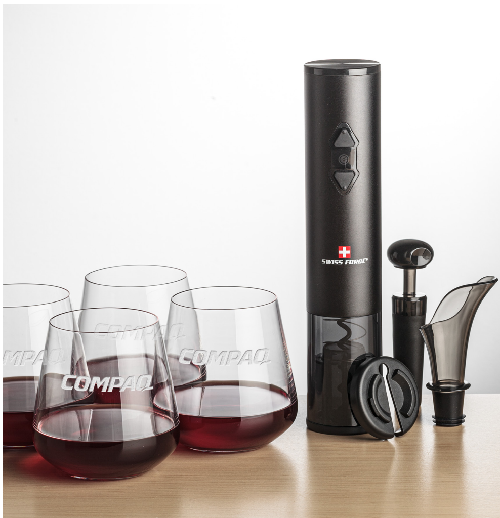
Swiss Force® Opener & 4 Breckland Wine BWA1031-4BK Available in Sets of 2's or 4's