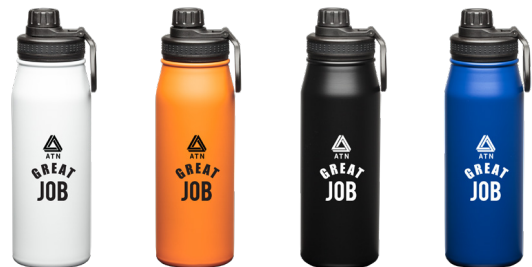
WHITE ORANGE BLACK ROYAL BLUE