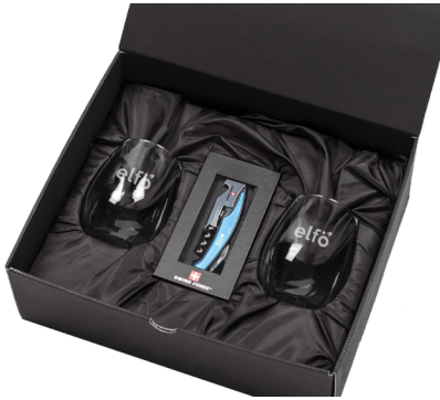
All Packaged in a Premium Satin-Lined Gift box