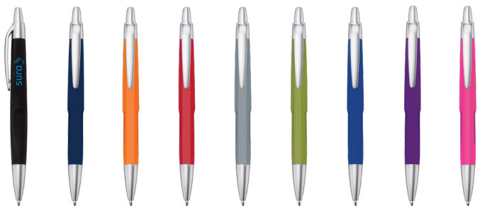
BLACK NAVY ORANGE RED GRAY GREEN BLUE PURPLE PINK