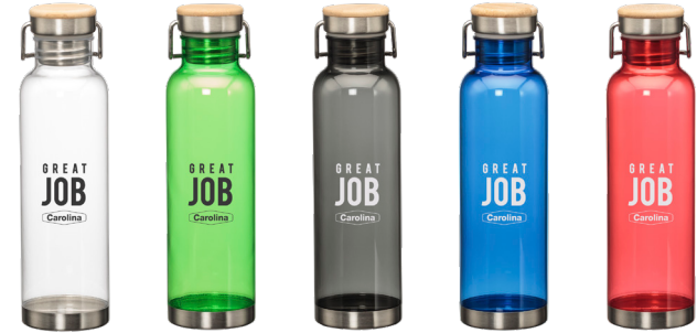
CLEAR GREEN BLACK BLUE RED

MacLeod Tritan Bottle with Bamboo Twist Lid offers a modern style with its bamboo twist lid and 5 colors to choose from. Also featuring a stainless-steel carrying handle, this bottle is great for on-the-go.