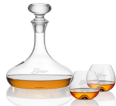
Stratford Decanter & Boston Stemless Cognac BWC7634-2BS