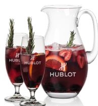
Pinehurst Cocktail Set BWC12251-2PH