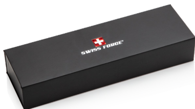
Swiss Force® Gift Box