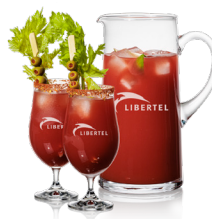
Rochdale Cocktail Set REX4011-2RD