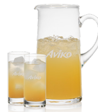
Rexdale Beverage Set REX401-2RD