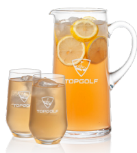
Bexley Beverage Set REX401-2BX