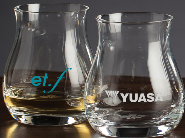
Glencairn Canadian Whiskey 10.5 oz Deep Etched / Imprinted