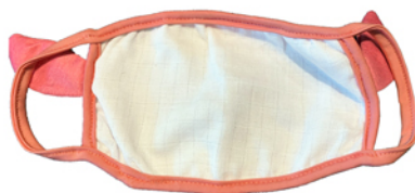
INSIDE OF MASK