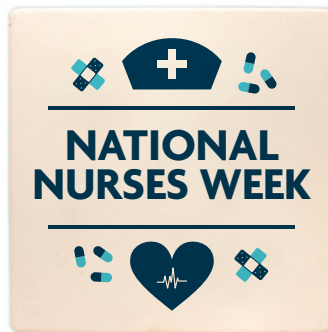
Square Trivet (CUTRSQ)