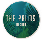
Car Coaster (CUCR)