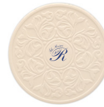
Victorian Lace (CUEC400)