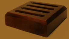
Slotted Stand for Round Coasters WS4