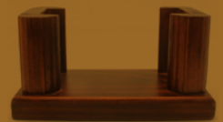
Cradle Stand for Round or Square WS13