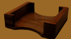
Flat Stand for Square WS20SQ