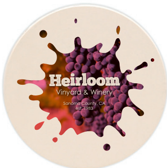
Round Trivet (CUTR)