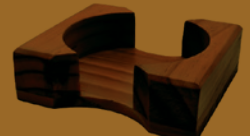
Flat Stand for Round WS20