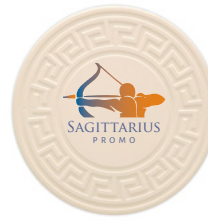
Greek Key (CUEC500)