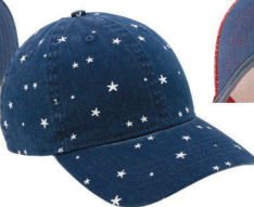
Navy w/ White Stars