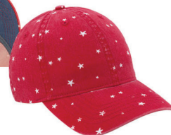
Red w/ White Stars