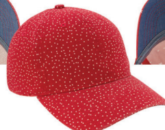
Red w/ White Polka Dots