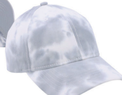
Tie Dye - Slate Blue