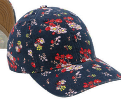
Dark Navy Floral