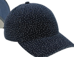
Navy w/ White Polka Dots