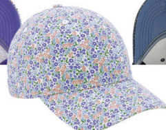
Lt Pink Pastel Floral