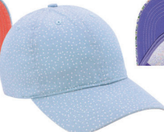
Lt Blue w/ White Polka Dots