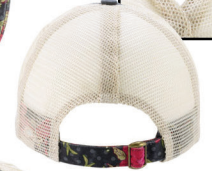
Black/ Khaki/ Floral