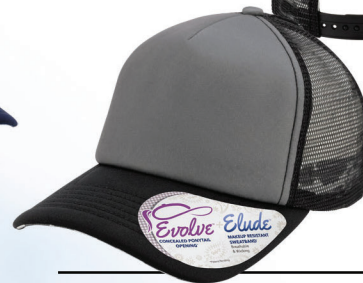
Slate/ Black/ Cow