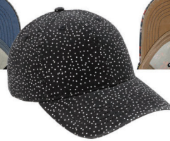
Black w/ White Polka Dots