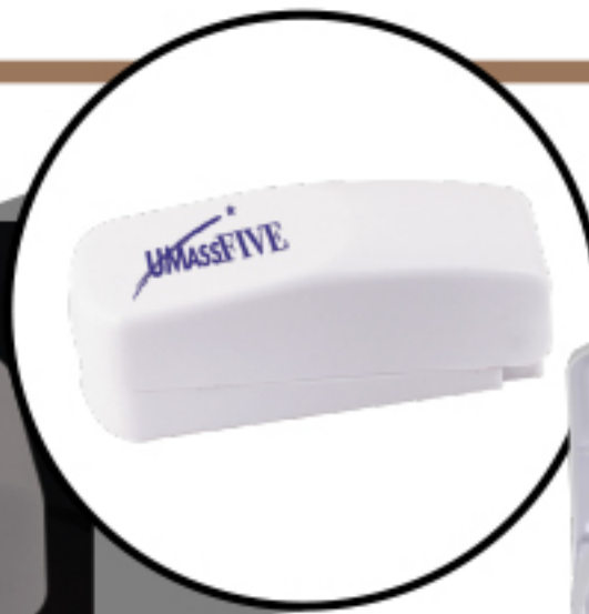
H222 SMOOTH-DOSE PILL SPLITTER as low as $1.97 (c) min 150