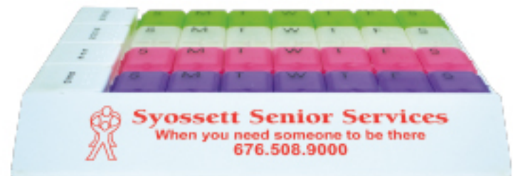
H795 FOUR WEEKS AND TODAY MEDICINE TRAY ORGANIZER as low as $5.13 (c) min 100