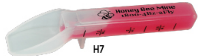
H7 BEDTIME MEDICINE SPOON as low as $0.85 (c) min 300

CLICK ON EACH PRODUCT FOR MORE INFORMATION!