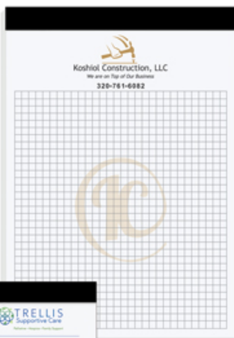
Full Color Sheets LPL84 8 1/4 x 11 3/4 Min. 250 6.27 (R) *Grids extra