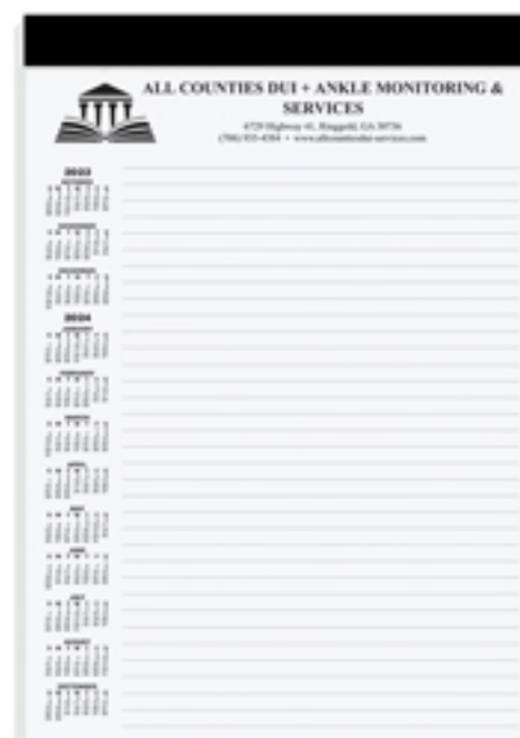
Imprinted Sheets LPL8, 8 1/4 x 11 3/4 Min. 250 $4.92 (R)