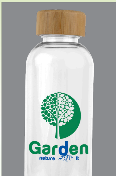
Multicolor Imprint Included In Price