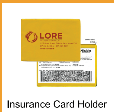
Insurance Card Holder