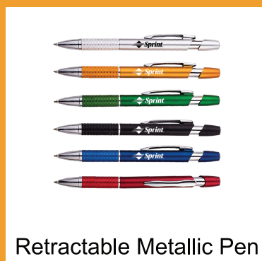
Retractable Metallic Pen