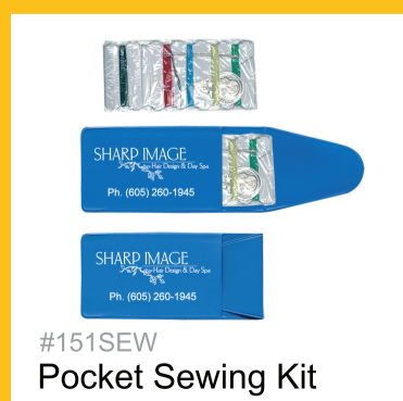
#151SEW Pocket Sewing Kit