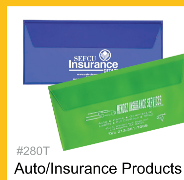
#280T Auto/Insurance Products

See our full product line at www.royalindustries.com