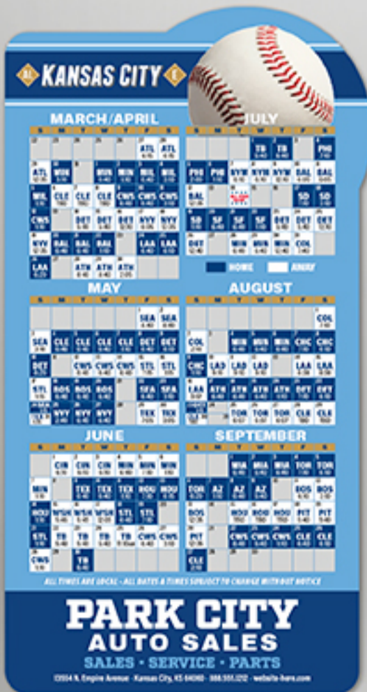
▲ 3⅞" x 7¼" Baseball Shape Schedule Magnet Item #829332025 | 25mil