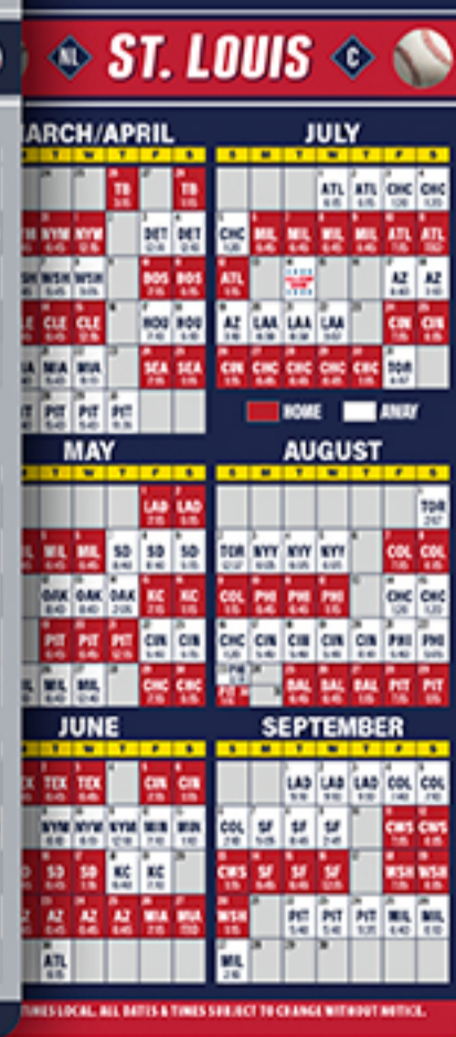
▲ Magna-Card (Business Card or House) Magnetic Baseball Schedules Item #471533 & 472533 | 3½" x 9"