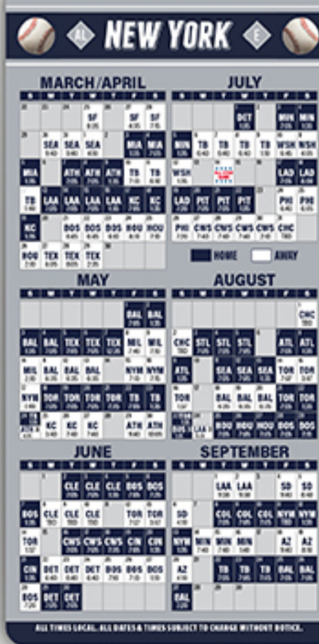
▲ Peel & Stick Business Card Magnetic Baseball Schedule Item #470533 | 3½" x 9"