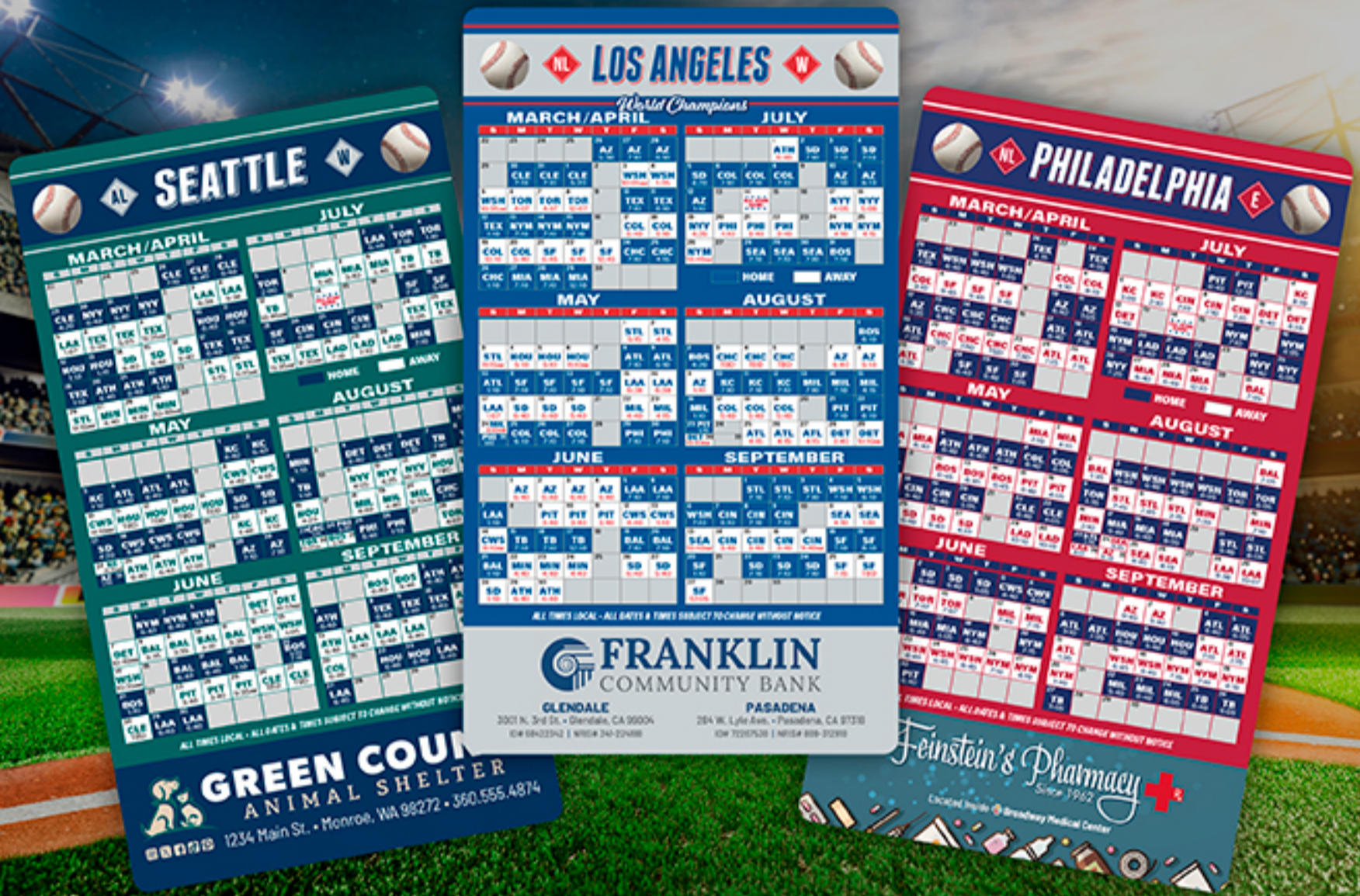
▲ 3½" x 6" Round Corner Baseball Schedule Magnet Item #821335225 | 25mil

ALL 30 PRO TEAMS AVAILABLE! Spring Training begins FEB. 20 | Opening Day is MAR. 25