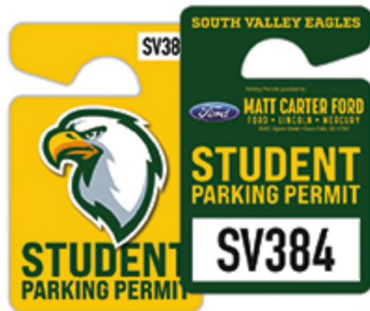
▲ 3" x 4½" Plastic Hang Tag Item #23043001PU UV-Coated (1S)