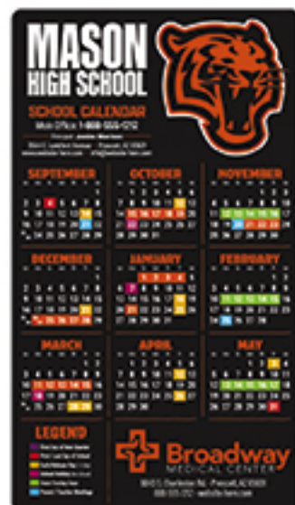
▲ 4" x 7" School Calendar Magnet Item #84023001