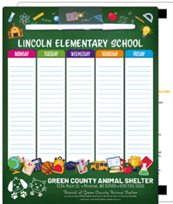
▲ 8½" x 11" School Memo Board Item #1000L | 14pt. Laminated